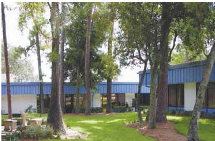
701 Kirkman Road, Orlando, FL, 32811