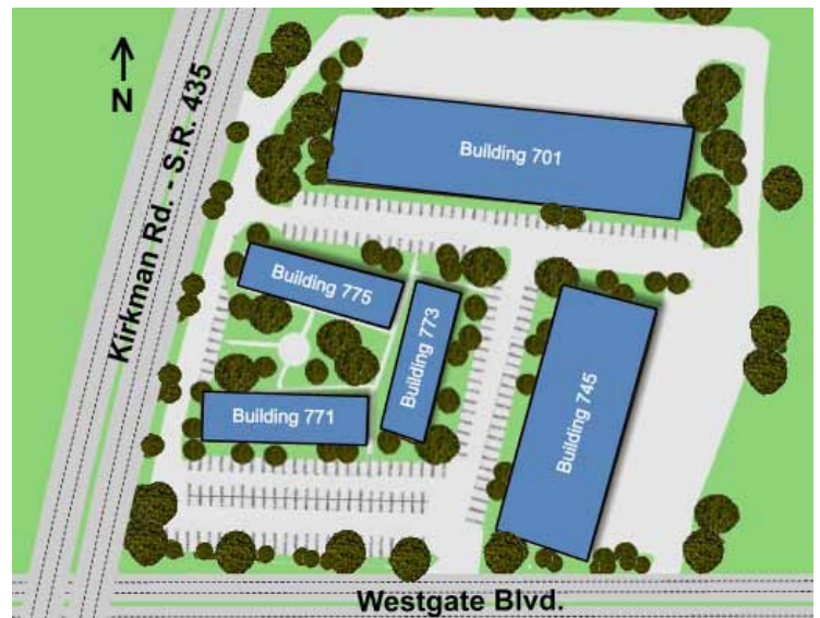
Kirkman Commerce Center Site Map