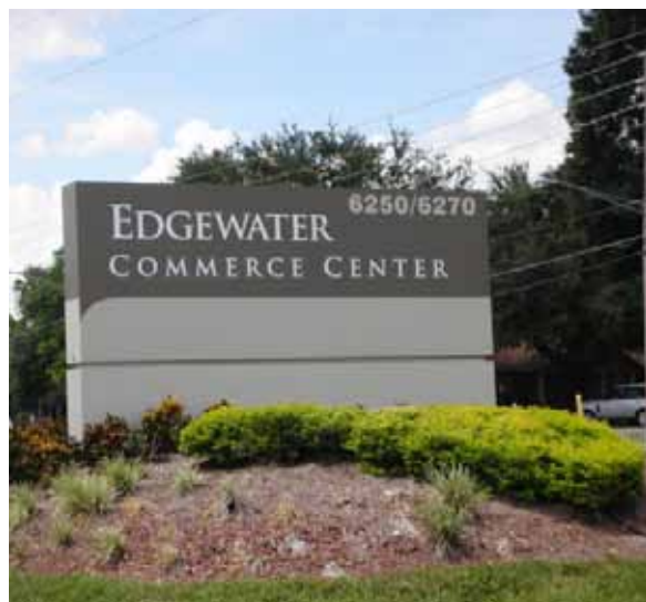
6250 Edgewater Drive, Orlando, FL, 32907